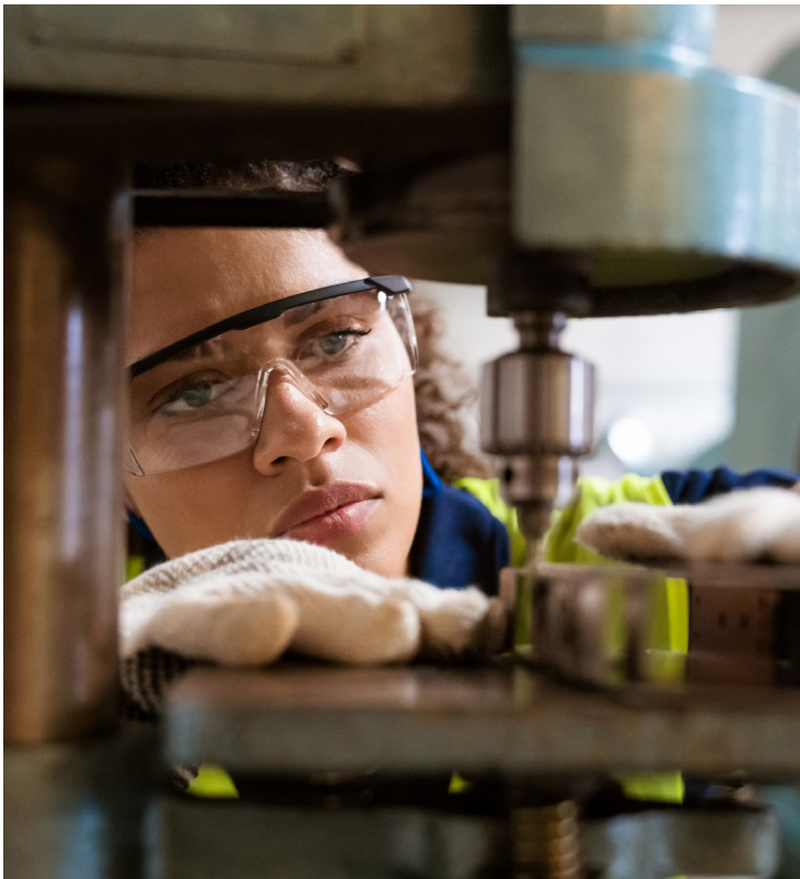
MACHINIST FALLS UNDER NATIONAL OCCUPATION CLASSIFICATION (NOC) CODE #7231/72100

Machinists are precise, logical, and safety minded. They often work with state-of-the-art equipment, and possess good concentration, mechanical ability and computer skills. Along with repairing products, machinists may also be called upon to fabricate specific parts from the appropriate material.