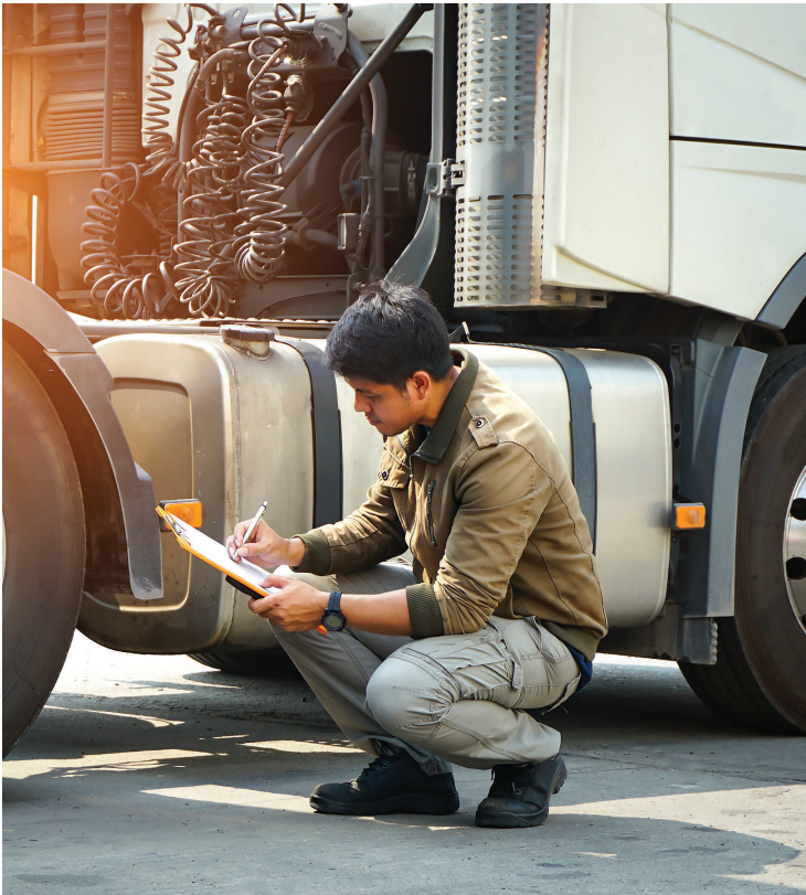
HET – TRUCK AND TRANSPORT FALLS UNDER NATIONAL OCCUPATION CLASSIFICATION (NOC) CODE #7312/72401

Heavy equipment technicians (HET) provide a critical service, helping ensure the safety of heavy vehicles and industrial equipment, and preventing risky, inconvenient, or costly breakdowns. Along with the physical service and repair work, they also interpret technical manuals and complete service reports.