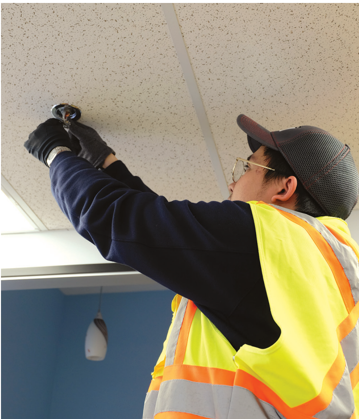
SPRINKLER FITTER FALLS UNDER NATIONAL OCCUPATION CLASSIFICATION (NOC) CODE #7252/72301

Sprinkler fitters perform precise, meticulous, and important work on one of the most critical safety systems of a commercial or industrial location. They are good communicators and often work in conjunction with other trades professionals.