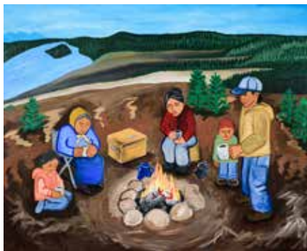
Bush Tea (Gwich'in)

An Elder patiently showing a young father how to feed and bond with his baby.