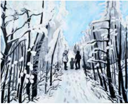
Winter Walk (Yellowknives Dene)

A toddler creating memories and a love for the outdoors.