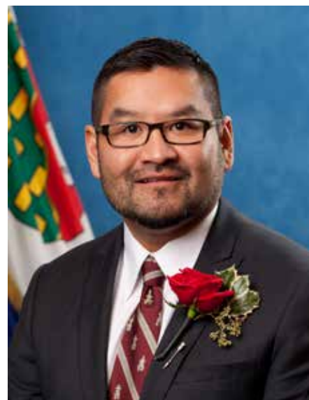
Alfred Moses Minister of Education, Culture and Employment