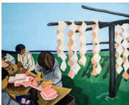
Whale Camp (Inuvialuit)

Getting ready to go outside to play, putting on boots and zipping up coats, becoming more independent, learning to take care of yourself.