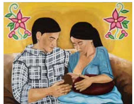
Home with Baby (Dehcho)

A clear day with no wind nor bugs, it is a nice day to work, share and pass down knowledge.