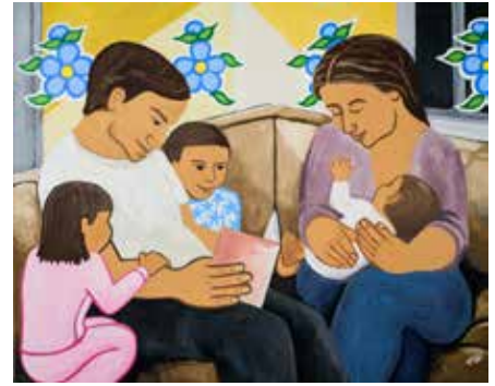
Family Time, Story Time (Tłıchʼo)

Indigenous women support each other in pregnancy, childbirth and early motherhood.