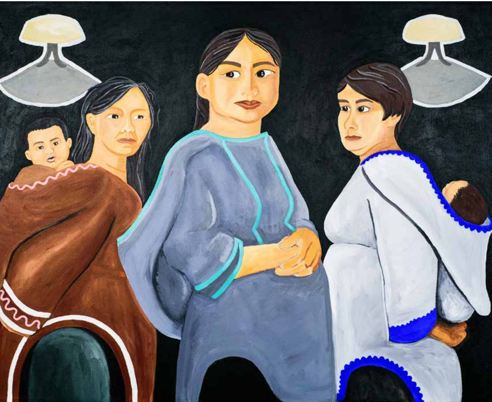
Three Mothers (Inuit) – Indigenous women support each other in pregnancy, childbirth and early motherhood.

Expectant mothers will have access to evidence-based services that support improved outcomes for mom and baby.