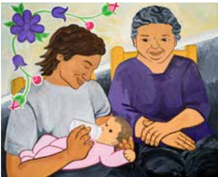
Feeding Baby (South Slave)

A family with young children spends time together during their bedtime routine.