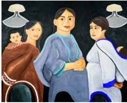
Three Mothers (Inuit)

A toddler creating memories and a love for the outdoors.