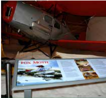
Bilingual Fox Moth interpretive panels

the Community Display Area, including a listening station for Tłıchq drum songs.