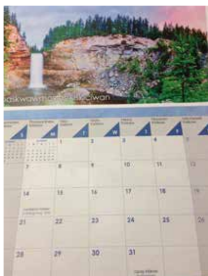
2013/2014 Cree Language Calendar.