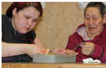
Lighting of the Quilliq at the 2013 Aboriginal Languages Symposium.

ECE hosted the 2nd Aboriginal Languages Symposium in Yellowknife on March 20th and 21st, 2013. The theme for the Symposium was Language through Generations: We Speak Who We Are . This theme