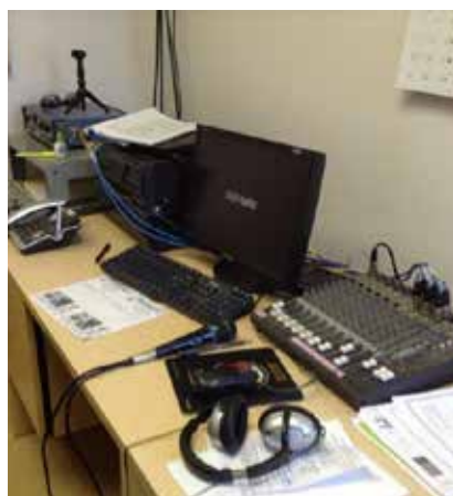
CBQO Radio: Délı̨ne's community radio station.