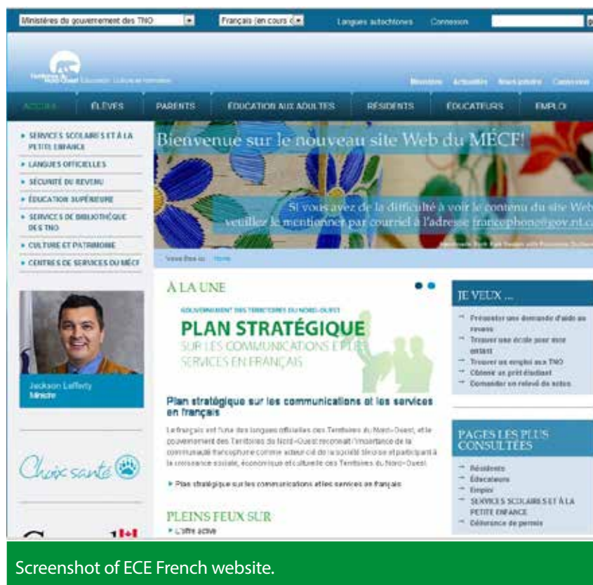
Screenshot of ECE French website.

Services TNO dealt with 194 requests for services in French. Almost all of those were from Yellowknife. Most requests related to the need for a notary public, issues around the NWT health care card and requests for hunting and fishing licenses. Staff continued to participate in community activities such as career and science fairs, information sessions and to provide interpretation services for ECE. Staff also participated in the elaboration of the new procedures for their role as webmasters for the French content of ECE's website.