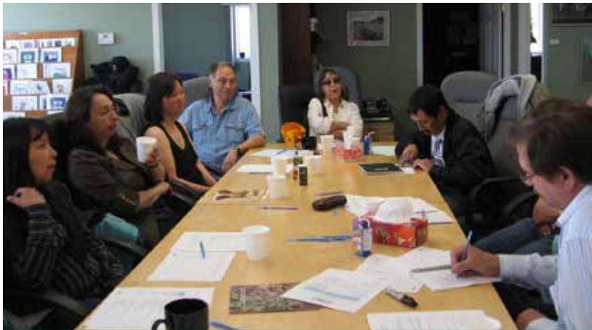
Inuvialuit and Inuinnaqtun language activists meet to develop their five-year Regional Aboriginal Languages Plan.

term objectives and proposed activities. The Plans also include proposed budgets and evaluation and reporting processes. The Plans outline clear and effective objectives to revitalize the languages on a community-by-community basis. They also outline specific goals and activities that can be tailored and implemented to meet the specific needs of each community and region, as well as the territory as a whole.