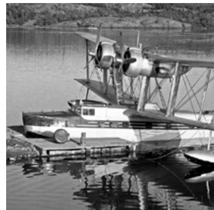
A Supermarine Stranraer moored on Back Bay in Yellowknife, 1956.

A CD of Tłı̄chq̓ Drum Songs was released in the summer of 2012. The formal release took place in Whati during the Tłı̄chq̓ Regional Gathering and the 16th Tłı̄chq̓ Assembly.