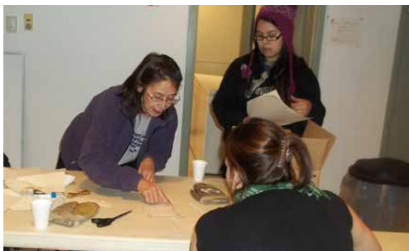
The Inuvialuit language instructor gives directions to youth in the combined language and sewing class in Paulatuk.

Aklavik and Tsiigehtchic, where participants collected and/or produced materials and photos;