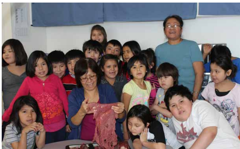
Fort Providence Deh Gah School South Slavey immersion teachers and students.