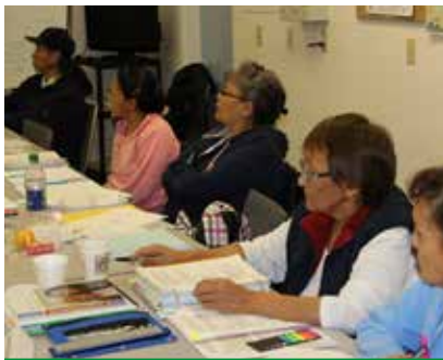
Aboriginal Languages Institute students, November 2012.

The first intake of students into the Aboriginal Languages Institute began in July 2010 and was completed in April 2012. Over the course of this partnership, a total of