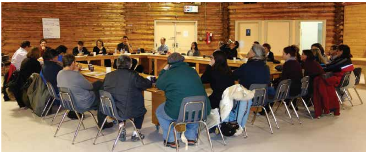
Minister's Forum on Addictions and Community Wellness meeting in Fort Smith.

Work continued on the interpretation of a series of Child and Family Services brochures on a variety of topics, now available through a toll-free automated phone line (1-855-297-5155). Currently, the line has information in Tłıchǫ, Chipewyan and North Slavey.