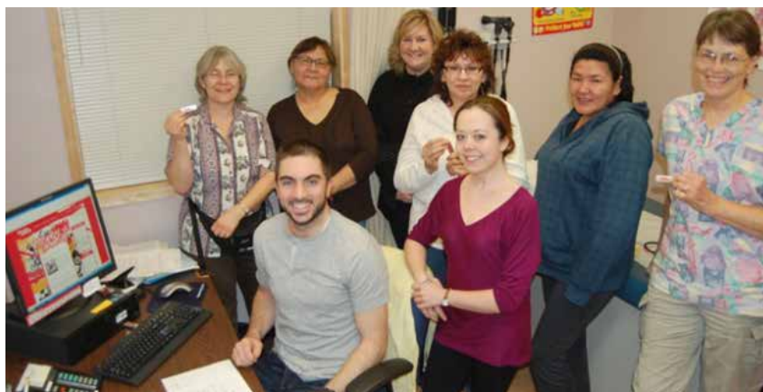
Teachers, Registered Nurses, Social Workers and Community Members in Aklavik learning about the "Respect Yourself" website.