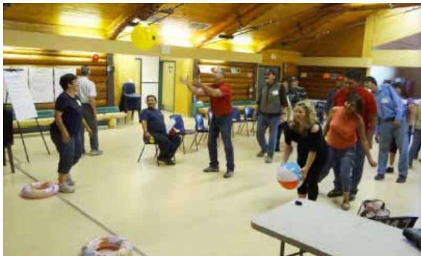
Cancer Sharing Circle, Fort Good Hope.

Staff members who spoke Chipewyan, Cree, North Slavey, South Slavey and Tłıchq were available to facilitate conversations between Elders and health care professionals.