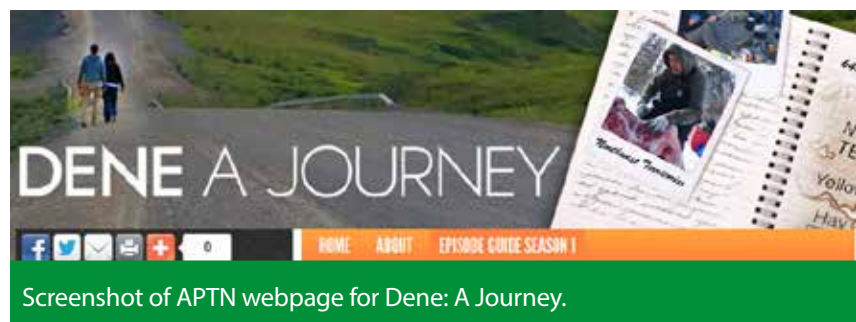
Screenshot of APTN webpage for Dene: A Journey.

Tusaayaksat , ICS's news magazine, celebrates and showcases the Inuvialuit voice across Canada. Mainly in English, Tusaayaksat translates select Elders' stories into one of the three Inuvialuktun dialects. In 2012/13, two issues were produced, translated and issued. The Spring