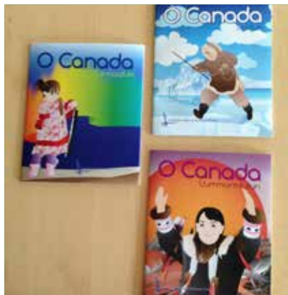
Covers of "O Canada" booklets in Inuinnaqtun (Kangiryuarmiutun), Siglitun and Ummarmiutun.